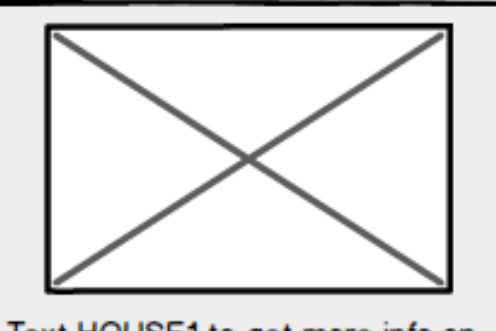
Exhibit A3: Sample Compliant Single-Message Print Advertisement and Service Messages

Text HOUSE1 to get more info on this property from Best Realty. Msg&data rates may apply. Go to website.com/sms for privacy and terms info.