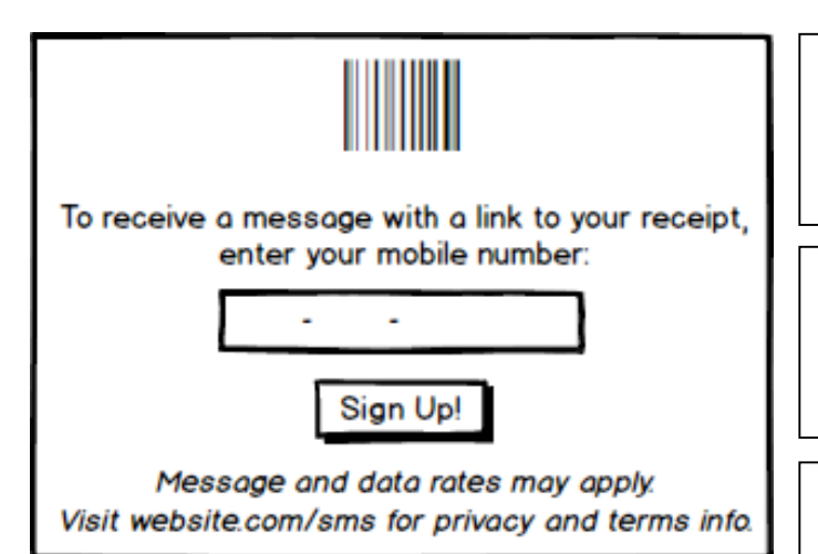
Exhibit B5: Sample Compliant Single-Message POS Advertisement and Service Messages