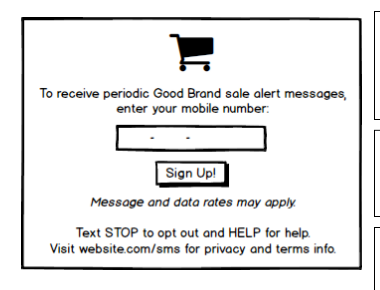
Exhibit B6: Sample Compliant Recurring-Messages POS Advertisement and Service Messages